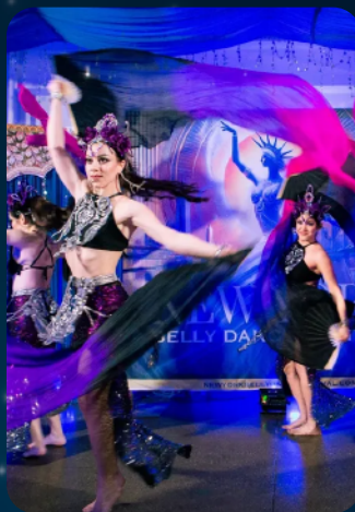
Evening gala performances