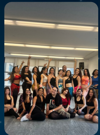
A welcoming, inclusive, and international community atmosphere

NYBDF is a space to celebrate artistry, honor culture, and experience dance as a powerful form of expression and connection.