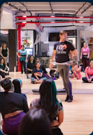
Educational workshops with world-class instructors

The New York Belly Dance Festival is a two-day cultural dance experience bringing together dancers, teachers, and enthusiasts from around the world. The festival blends the rich traditions of belly dance with the vibrant creative energy of New York City, offering: