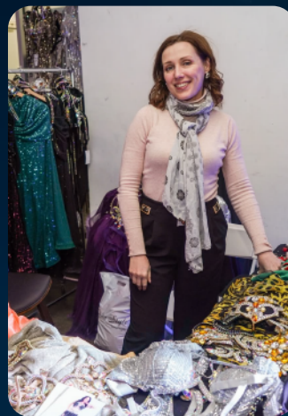
A curated vendor bazaar